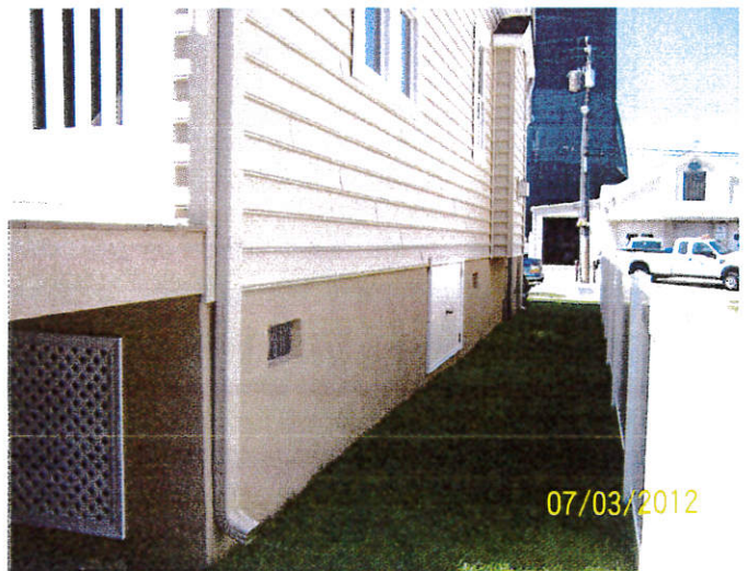
Left Side View – Date of Photograph: (See Photo Stamp)